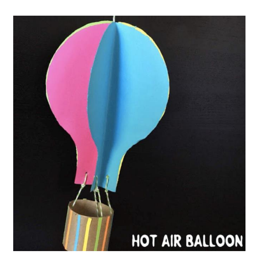
Hot Air Balloon Spinner